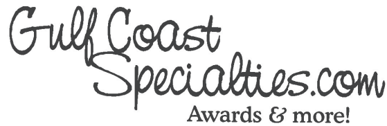
Gulf Coast Specialties